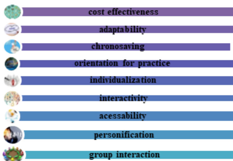
Figure 3: Advantages of Google Classroom implementation into the educational process.

to be performed during the lessons, but also links to useful resources, including a discipline site, created by means of Google service. It is advisable to fill the course with lectures, practical classes, individual tasks for students and links to information resources that may be needed while doing a course: textbooks, manuals, regulations, Internet resources, videos, etc. Such availability of teaching aids, opportunity to review and look through them again and again provide necessary conditions for the internalization of the learning materials. The Google Classroom e-learning environment also allows users to import elements from other services, including small interactive LearningApps.org modules, which can be used directly as educational or training resources and allow students to learn the most important categories of the course in a form of a game. The advantages of cloud computing in the educational environment provide an opportunity to consider them as a deterministic component of the impact on professionally important and personality-oriented competencies development [22].