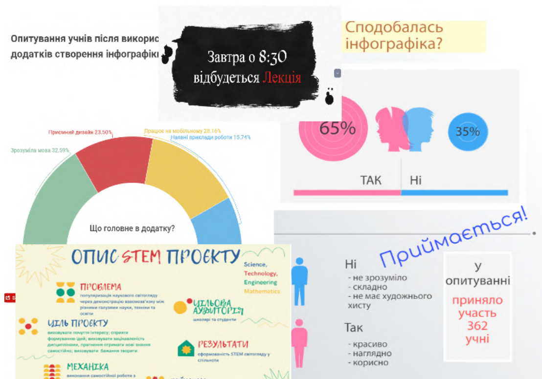
Figure 1: The results of a survey of students on the means of creating infographics.

of users through mobile systems exceeded the number of users through a stationary computer system. In third place was the design criterion (23.5%). And although the systems that were proposed were directly related to graphic design, the ergonomics of these systems still need to be improved. In last place was the criterion of “available examples of work” (15.7%). In our understanding, this is the “worst” criterion and it is gratifying that the smallest number of students is ready to do tasks on the model, because the capabilities of the systems are sufficient for creativity and creative presentation of information.