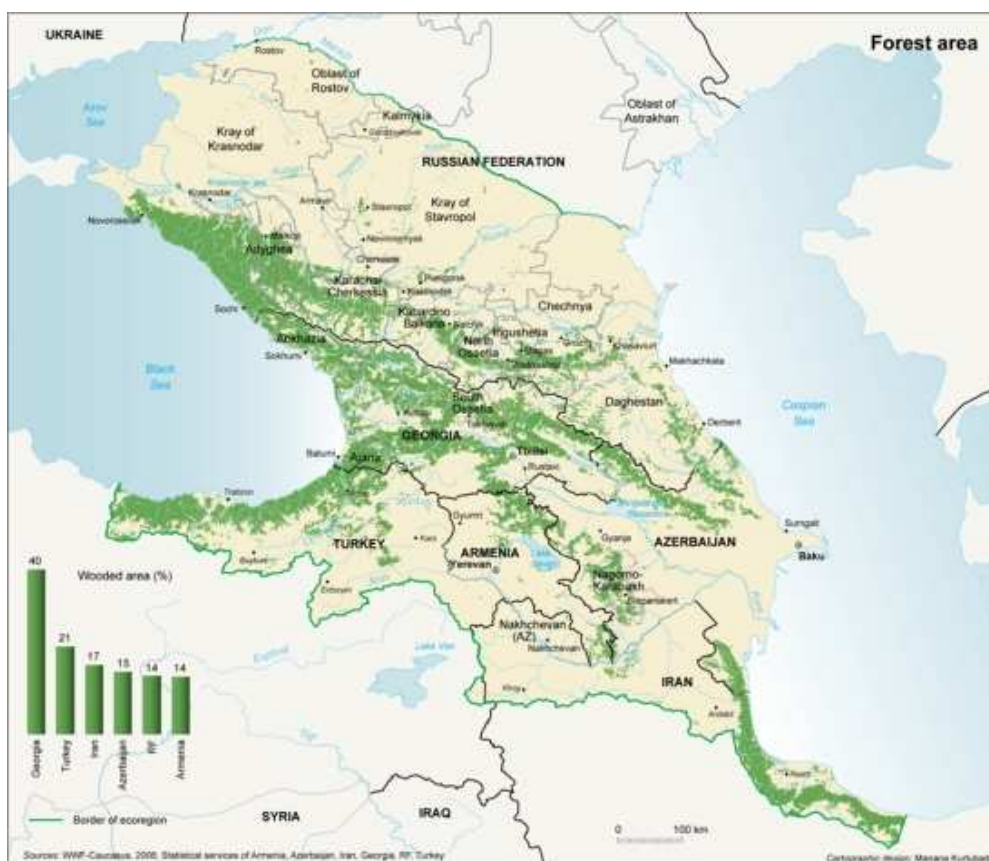
Fig. 4. Forest area in Caucasus [11]

the use of water resources are expected to aggravate in such regions. Such state of affairs has its effect not only on the population of mountains and lowlands, but also on the relations between the states, which use the resources of transboundary rivers.