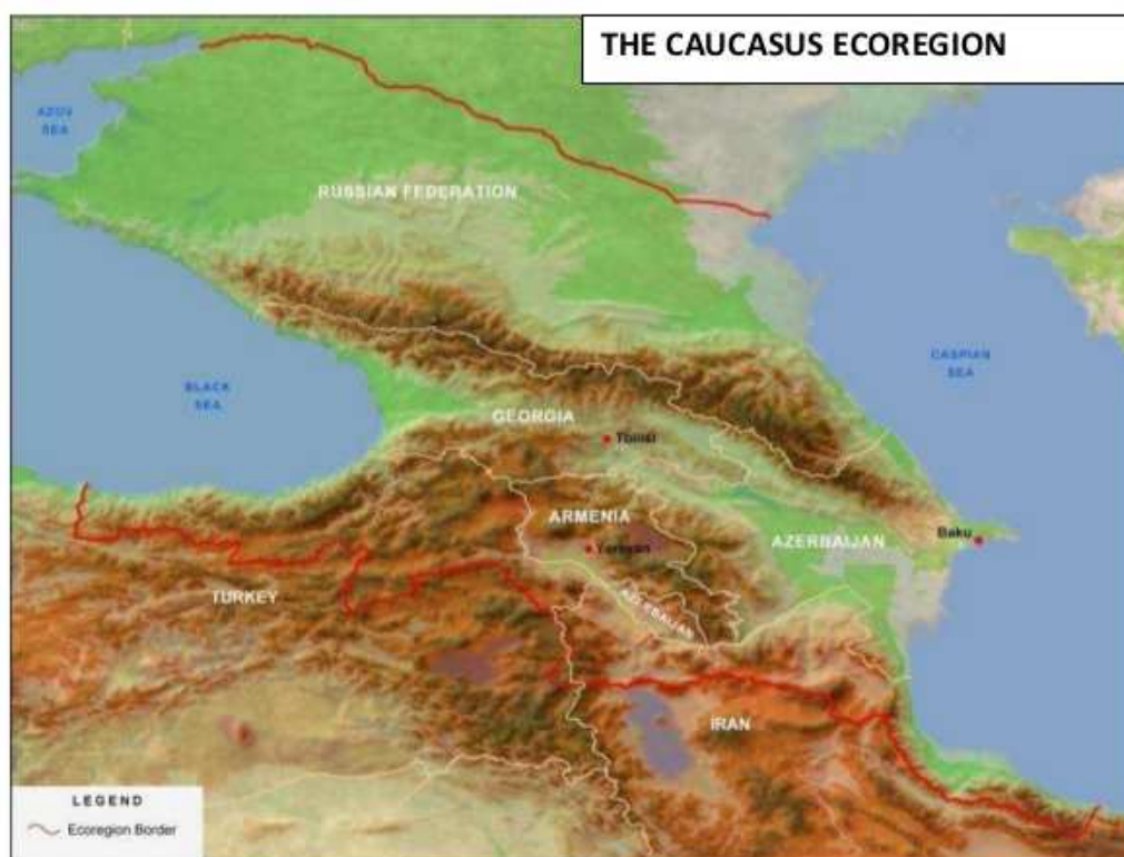
Fig. 1. Caucasus ecoregion (WWF Caucasus office, 2006)

population is 35 million with the population density of almost 80 per km 2 . Today, the international environmental organizations consider the Caucasia as one of the most important eco-regions and geographical formations of the world and area comprising the territories of 6 states: the south-western part of Russia (the North Caucasus), the countries of the Southern Caucasia: Georgia, Azerbaijan and Armenia and also portions of northeastern Turkey and northwestern Iran. In this view, the area of the Caucasia is 580 thousand km 2 .