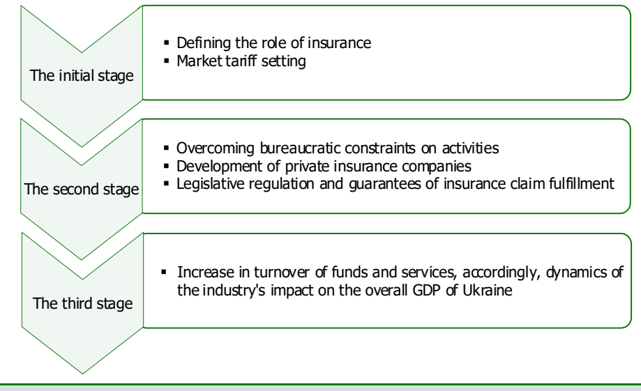
Figure 2. Model of the impact of insurance companies on post-war economic recovery in Ukraine.

To normalize the situation and facilitate the recovery of the industry from the crisis, it is suggested to utilize a model of the impact of insurance companies on the overall economic recovery of Ukraine. Undoubtedly, fully accounting for all possible changes in Ukraine's post-war situation is extremely challenging, as there is a lack of similar experiences in other countries. It is evident that the role of insurance should not be overstated; however, this economic sector can play a significant role in the growth of GDP. Therefore, the proposed model will look as follows (Figure 2):