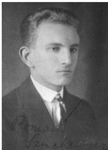
Photo 2. Roman Shukhewych in his Students Years. Lviv, 1926