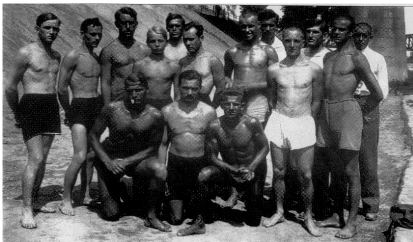
Photo 3. Prhemysl 1937. Swimming Section of the UCS «Berkut» on the San River in Pshemysl [16]