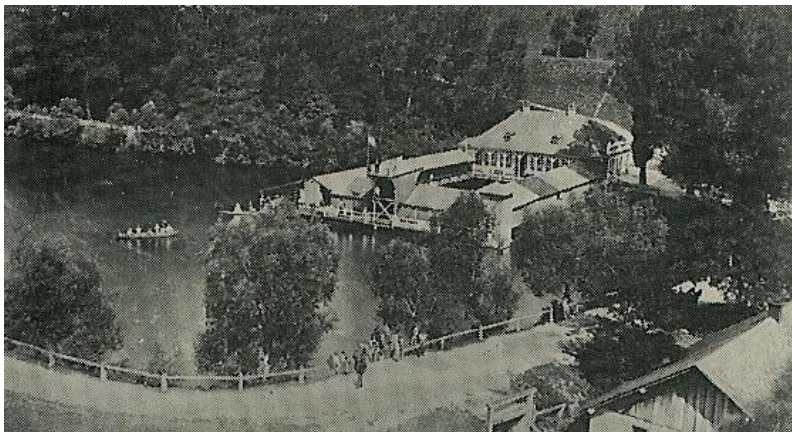
Photo 1. Full Pond in Lviv in the Interwar Period, Where Summer Swimming Competitions and Hockey in Winter Were Held

After the establishment of the «Swimming Proceedings», the Lviv Ukrainian Sports Alliance, which had been operating since 1925, had created the sport structure of this discipline. Judging courses were conducted, the publishing house was introduced, the regulations on sports were published, and training courses for swimming instructors from Lviv clubs were organized. The separate discipline, like a swimming was distinguished from the Zaporizhya Games. On September 12th, 1926, only swim competitions were held, where women competed for the first time.