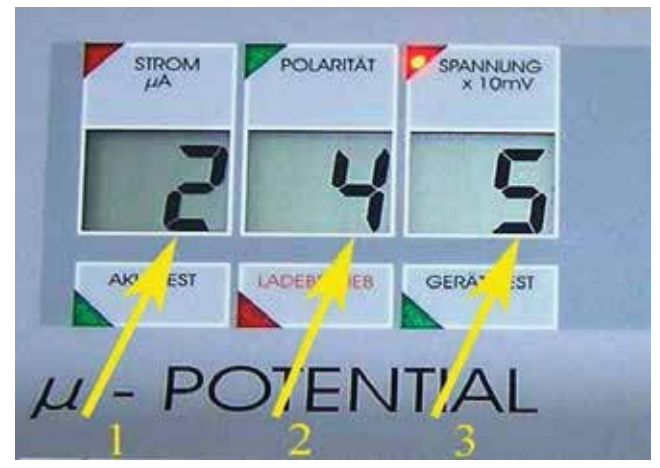
Fig. 3. Potentiometric indices of healthy people (indicated by arrows: 1 - current strength, 2 - electrical conductivity of oral fluid; 3 – potential difference, the last index should be multiplied by 10)

walls. The predominant lesion of the lower and external walls is explained by the localization of odontogenic focus of infection - the source of chronic maxillary sinusitis.