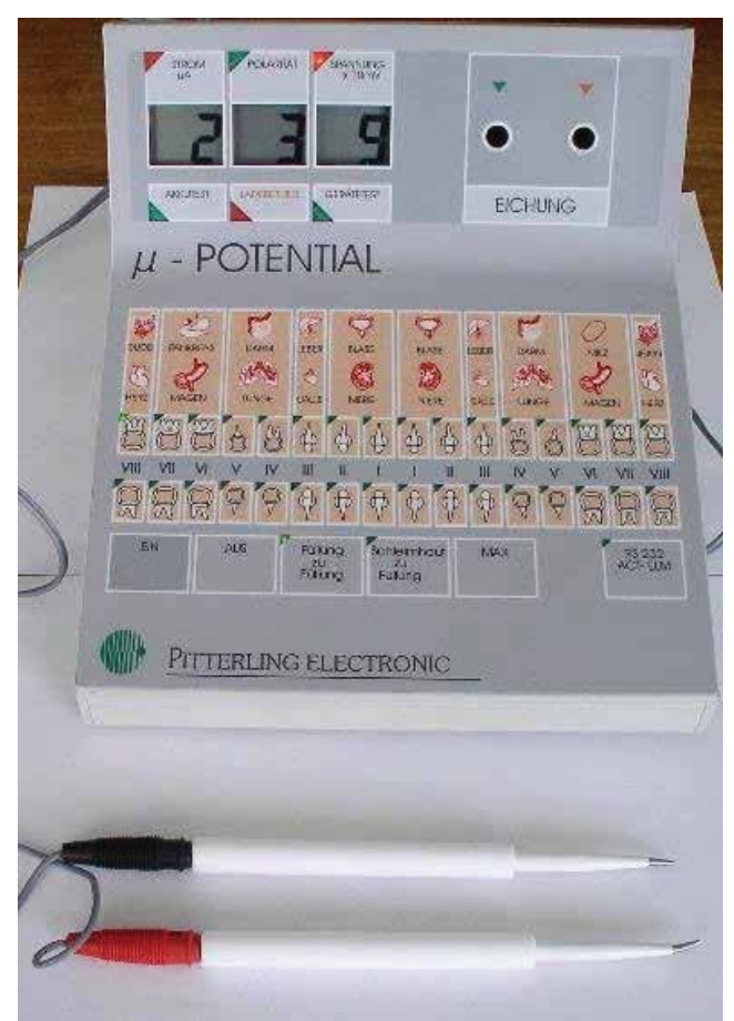
Fig. 2. External view of the automatic digital potentiometer Pitterling Electronic

On radiographs and computed tomograms of the nasal cavities in observation group of patients there was darkening of the maxillary sinuses in all subjects, which was limited in nature with predominant lesion of its inferior and external