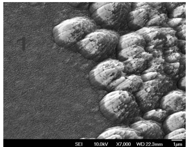
Fig. 1. Image of the \text{Er}_2\text{O}_3/\text{por-SiC}/\text{SiC} structure: 1 – porous layer, 2 – \text{Er}_2\text{O}_3 film, which was obtained by scanning electron microscopy.

As follows from the Auger spectrometry data, when growing erbium oxides, heat treatment makes it possible to form oxide Er layers with uniform thickness, composition of which would be close to the stoichiometric one. The observed changes in the composition of oxide phases in the near-boundary layers and their extent are related with the conditions for preparing the oxide.