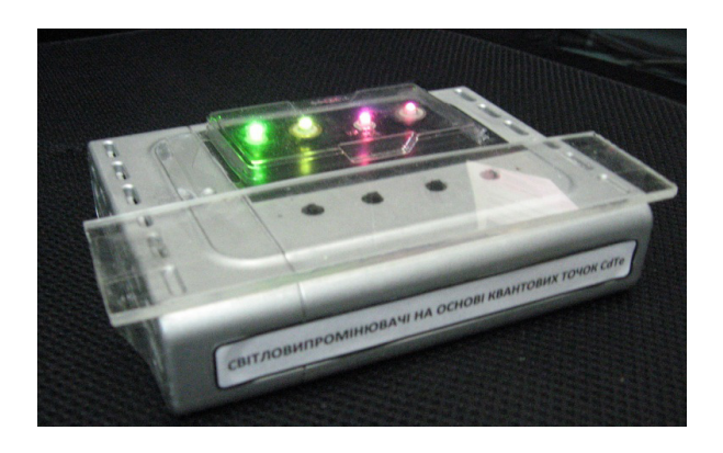
Fig. 3. Conversion semiconductor LED based on nc-CdTe.