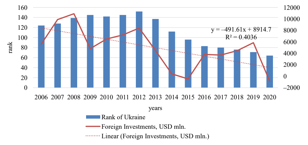
Fig. 1. Correlations of Ukrainians place in Doing Business and foreign investments: y-axis is the level of investment income

One of the main causes of market stagnation mergers and acquisitions - uncertainty of companies in the future, in the possibility of fast exit from the recession. All last year, companies tried to improve their own liquidity. The situation prompted top management many companies focus on issues improving operational efficiency by releasing related tasks with business development. The global M&A market showed double-digit growth in 2021 (+47 % in value and +31 % in volume compared to 2020). The year for the M&A market in the world was a new record - 48,948 transactions in the amount of 4,418 billion US dollars, which surpassed the previous records in 2007 (3,833 billion US dollars) in value and in 2017 in terms of volume (37,437 transactions). Less than in pre-crisis times, availability of credit resources in the background declining profits of many companies have made the acquisition of other businesses more difficult even despite the fact that the market value of the potential objects of acquisition has decreased significantly [27-29].