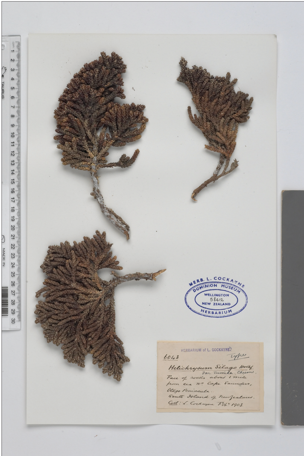
Fig. 2. Lectotype of Helichrysum selago var. tumidum Cheeseman, WELT-SP058412