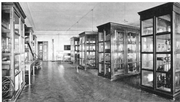
Photo 5. Museum of physical apparatus, 1903

to collect all the best from the equipment that he saw in foreign laboratories.