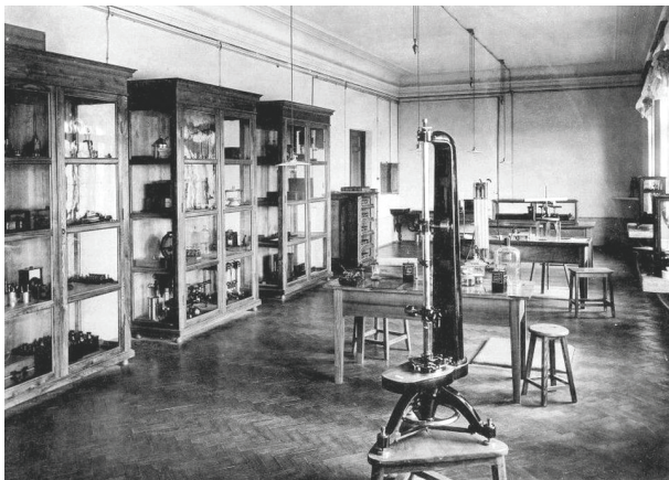
Photo 4. Laboratory of precise measurements, 1903