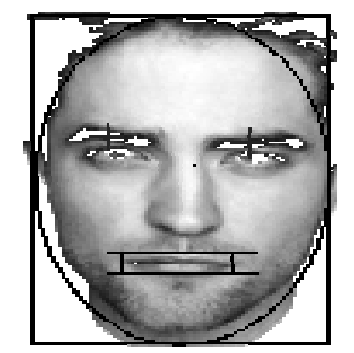
Fig. 2. Face with the special points

The results of the program work can be seen on the Fig. 2.