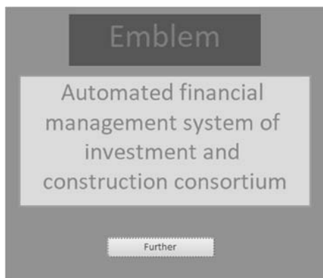
Fig. 1. The main menu of the system

The developed information system, the interface of which is shown in Fig. 1-3.