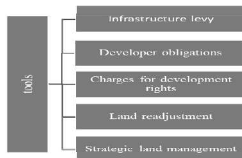
Fig. 1. Tools for capturing land value (author's generalization based on source [1])

Infrastructure fee is a tax (fee) paid by owners of land plots whose value has increased as a result of public (or municipal) infrastructure investments. By paying this type of fiscal payment, landowners contribute to the development (maintenance) of public roads, transportation, communications, parks, etc. The