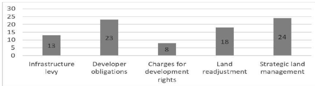
Fig. 2. Availability of tools to capture land value in European countries (number of repetitions). Author's development according to [1]. The sample was conducted among 27 countries.

to the improvements made during the redevelopment. In European practice, such work is based on a private initiative, which is actively supported by local governments, the main tool for the transition from rural to urban land use. There is also an active merger (consolidation) of agricultural land to increase the efficiency of its use. In Southern European countries (Italy, Spain), this type of work is carried out to restore land uses that have been damaged by natural disasters. Northern European countries (Finland) use this mechanism to consolidate forest lands, Estonia to lay railroad tracks, etc. It is also used to simplify integrated property ownership in areas of existing right-of-way (Israel).