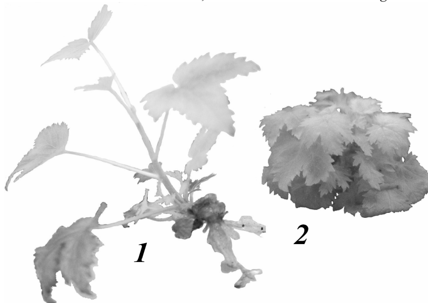
Figure 2. Plants response to exogenous cytokinin (BAP 0,5 mg/l) depending on the plants species: 1. Ribes nigrum L. apical dominance sprout; 2. Ribes rubrum L. sprouts rosettes.

2,0 mg/l enlarged the number of vitrified plants significantly. The largest amount of vitrified organisms was observed in R. Grossularia - 69%, and the smallest one - in R. nigrum .