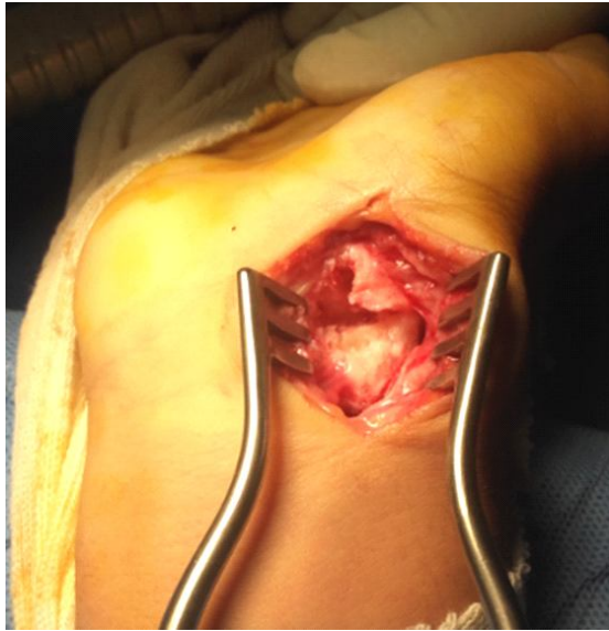
Fig. 2. Healing of the site and digging of a trench

two pins is recommended in order to stabilize the assembly (Fig3), and postoperative immobilization in plaster splint for three months. The clinical outcomes were evaluated according to the Michon score [4]. The pain was assessed in five stages. The flexion and extension mobilities were compared with the contralateral side.