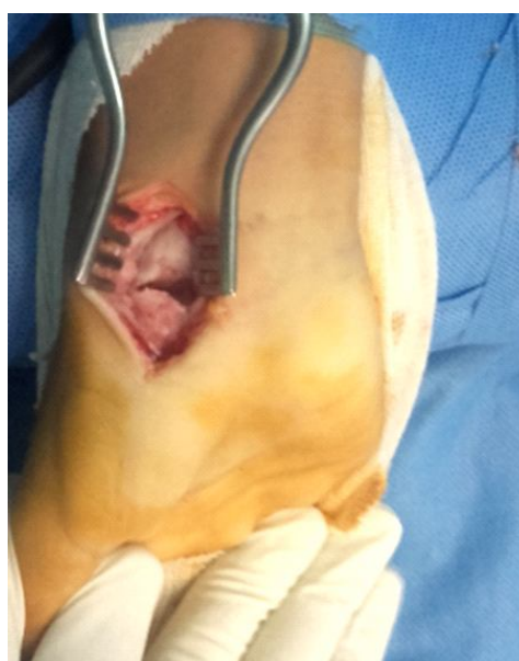
Fig. 1. Anterior arthrotomy and exposure of the non-union source

Our patients were operated by several operators, according to the Matti-Russe technique, anteriorly, excision of the non-union site (Fig1, Fig2), with the placement of a cortico-cancellous graft taken from the ipsilateral iliac crest, osteosynthesis using