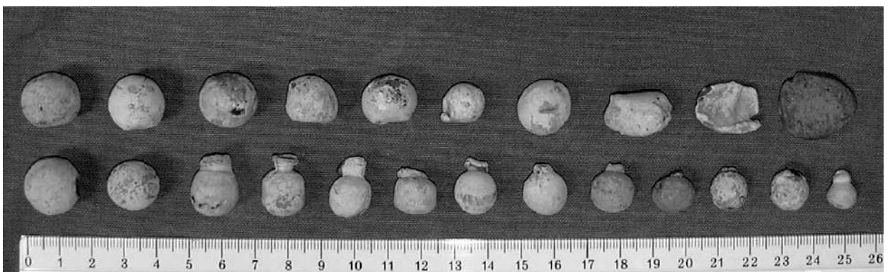
Fig. 3. Examples of 17 th century ammunition

Building on the success of the Little Bighorn project, scholars followed the methodology outlined by Scott and began using metal detectors to survey other battlefields. By plotting the distribution of artifacts along a several square mile X and Y grid, it became possible to identify patterns across great distances.