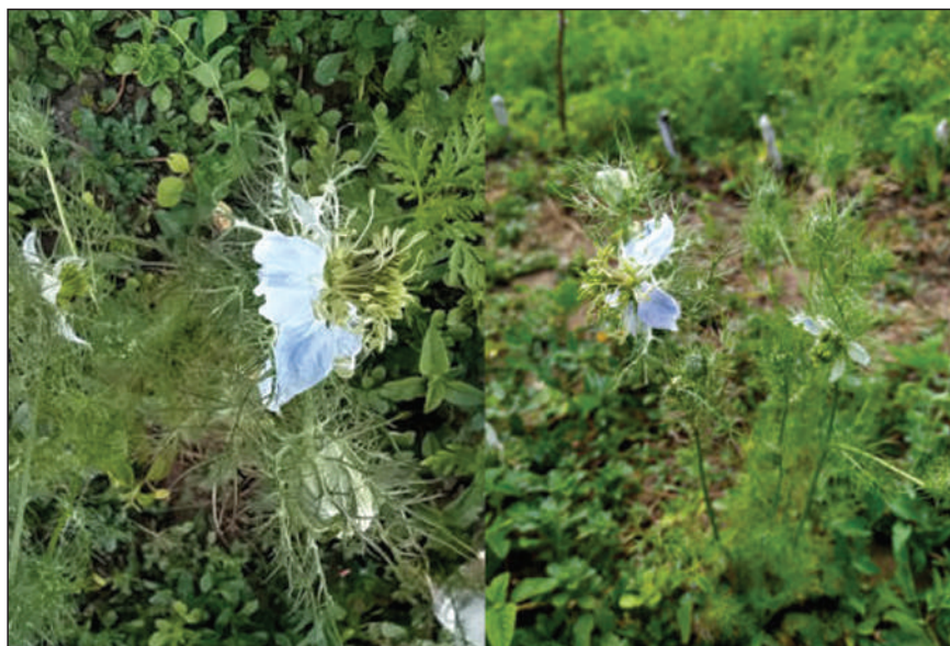
Fig. 7. N. damascena cv. Bereginya plants treated with 0.5 % DG-2, with an exposure of 6 hours, M 3 generation, 2 years, 2 months and 3 weeks after treatment, with the mutation flower rotated 90 degrees