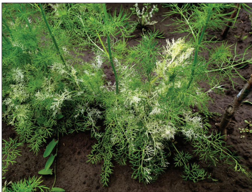
Fig. 2. N. damascena cv. Charivnytsya plants treated with 0.05 % DG-2, with an exposure of 6 h, M 3 generation, 2 years, 2 months and 2 weeks after treatment, with the mutation of white plant parts

In our experiment, we discovered, as far as we know, for the first time, hereditary changes such as witches' broom-like leaf bushes ( Fig. 3 ), widely spaced internodes ( Fig. 4, a ).