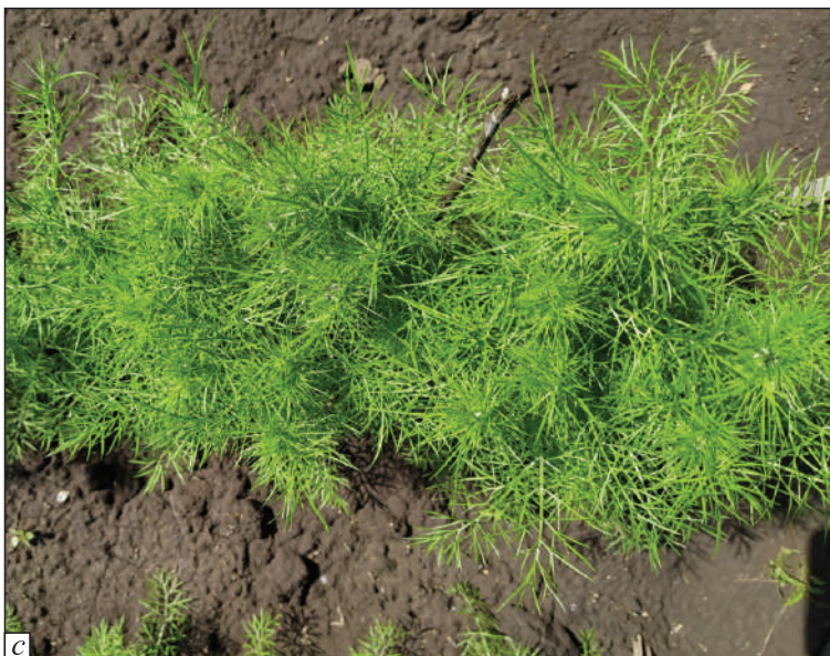
Fig. 6. N. damascena cv. Charivnytsya plants treated with 0.01 % NMU, with an exposure of 16 h, a – M 3 generation, 2 years, 2 months and 1 week after treatment, with the mutation of fleshy petioles, b – M 3 generation, 2 years, 2 months and 2 weeks after treatment, with the mutation of fleshy petioles, c – N. damascena cv. Charivnytsya control plants