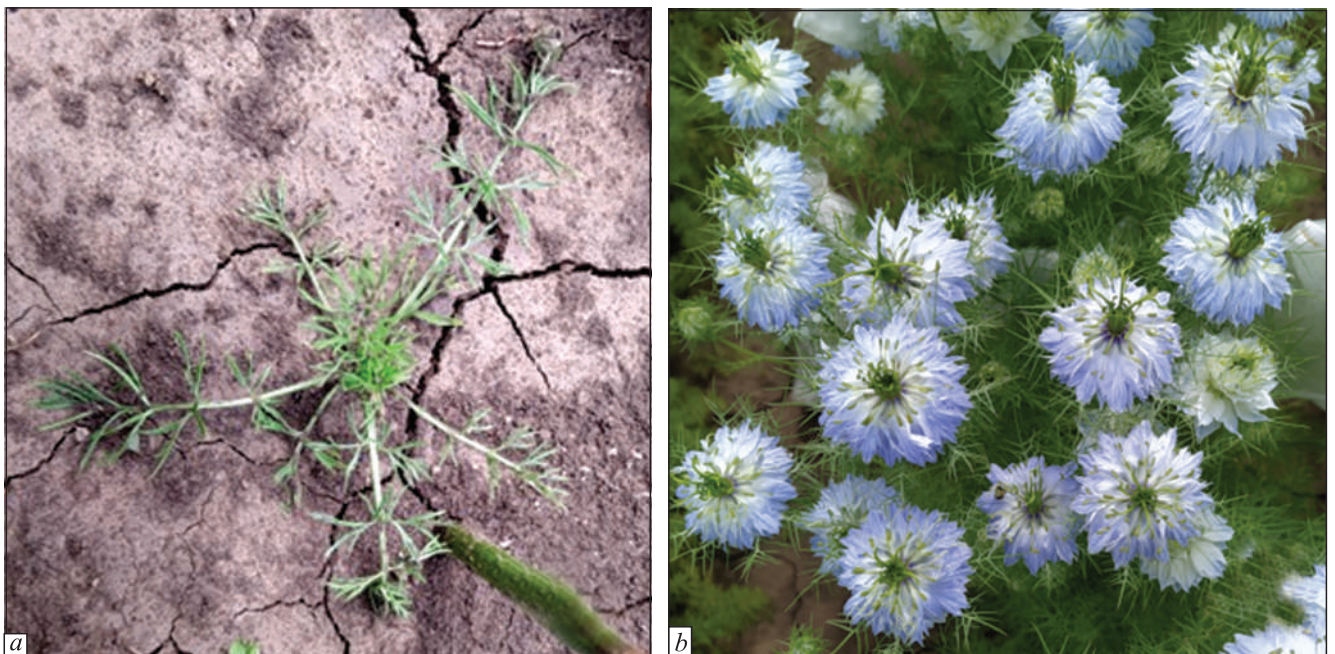
Fig. 4. N. damascena cv. Charivnytsya plants treated with 0.01 % NMU, with an exposure of 6 hours, M 3 generation, 2 years, 2 months and 2 weeks after treatment, with ( a ) the mutation of widely spaced internodes, and ( b ) cv. Charivnytsya plants treated with 0.5 % DG-2, with an exposure of 16 hours, M 3 generation, 2 years and 3 months after treatment the apetalous morph of N. damascena , so called double flower, mutation of a white flower with a blue brim ( b )

the flower, after blooming, fills with color as the gynoecium and androecium develop. At first, the flowers are light, gradually they turn blue and by the time the petal-like sepals fall off, they turn dark blue. In mutants with the trait flower with a blue margin, the light ring in the color of the flower is retained at the