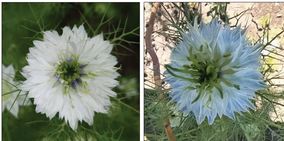
Fig. 10. N. damascena with the mutation a white flower (double) (left) a blue flower with white margin (right)

white flower with a blue brim (Fig. 5, b and 6), and a blue flower with white ( Fig. 10 ).