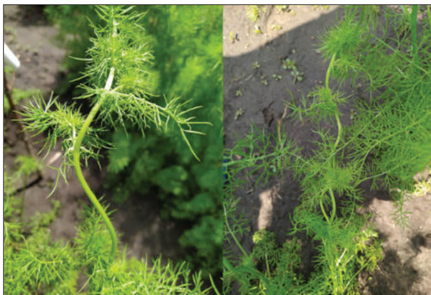
Fig. 8. N. damascena cv. Charivnytsya plants treated with 0.5 % of DG-2, with an exposure of 6 hours, M 3 generation, 2 years, 2 months and 2 weeks after treatment, with the mutation of convolute (crooked) flower spike and stem

later stages of flower development, and the flowers are two-colored. Plants with this trait are fertile, the trait is passed on to offspring and does not split.