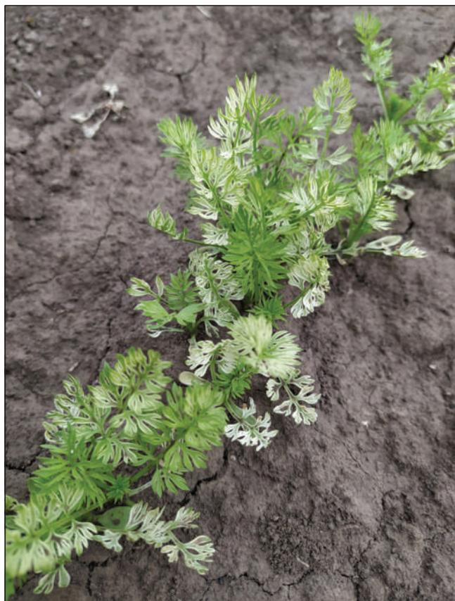
Fig. 1. N. damascena cv. Bereginya plants treated with 0.05 % NMU with an exposure of 16 h, M 3 generation, 2 years and 2 months after treatment, with so-called light green margin mutation

two groups: 1) mutations in the flower structure and 2) those in the corolla petal color. We also found a group of mutations not described by Tigova and Soroka (2019), namely mutations in the structure of the seed capsule.