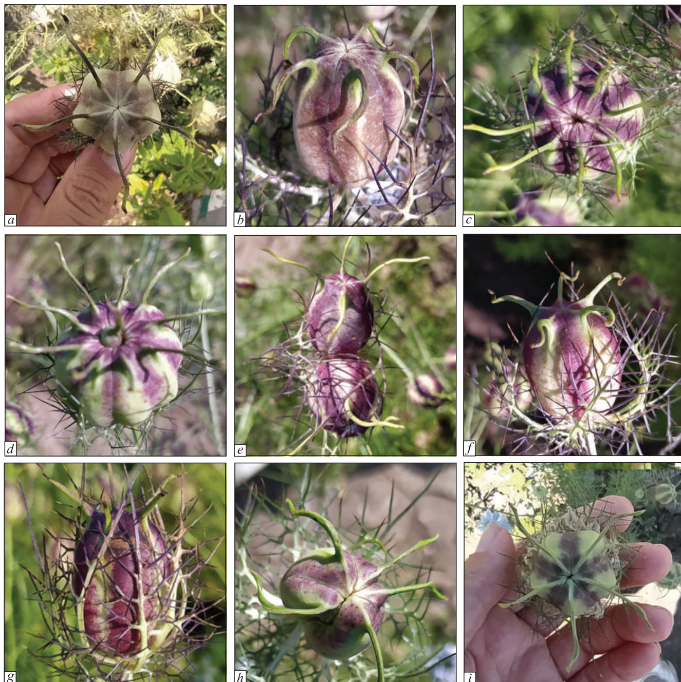
Fig. 9. N. damascena with the mutation a–b : ribbed capsule, c – spherical round capsules, d – multisegmented capsule, e – several fused capsules, f – capsules with helicoidal horns, g – elongated capsule, h – seed capsule deformation, i – pentagonal

spike and stem ( Fig. 8 ), abnormal branching, extended leaf blade, widely spaced internodes, fleshy petioles, absence of petioles on lower leaves, multiflorant (branched), high plants, low plants, dwarfs.