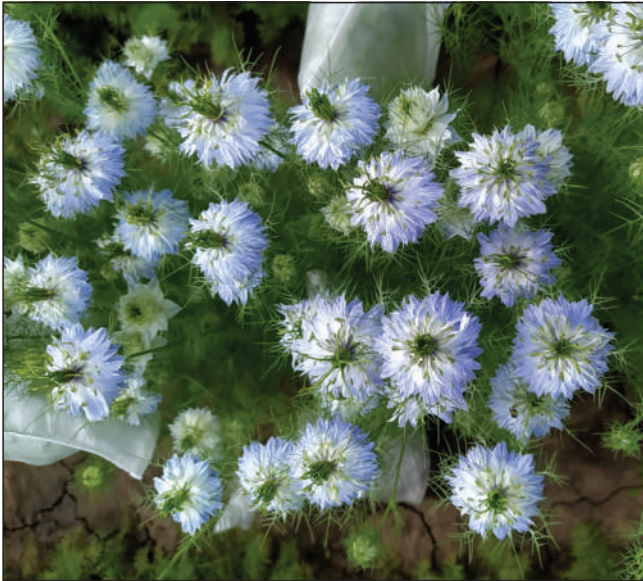
Fig. 5. N. damascena cv. Charivnytsya plants treated with 0.5 % DG-2, with an exposure of 16 h, M 3 generation, 2 years and 3 months after treatment the apetalous morph of N. damascena , so called double flower, mutation of a white flower with a blue brim