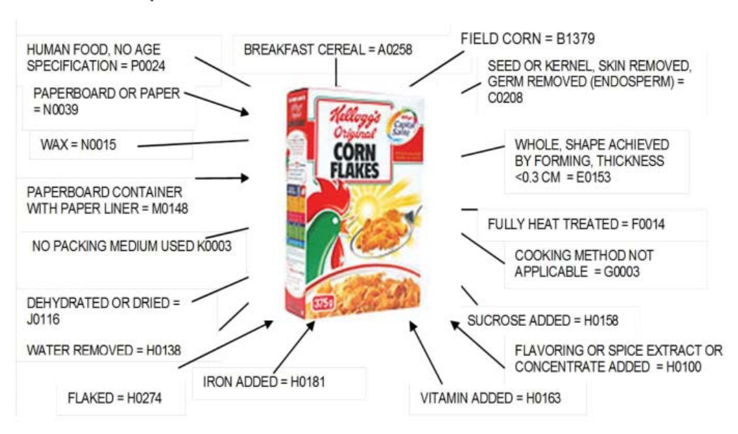
Fig. 1. Description of food by LanguaL