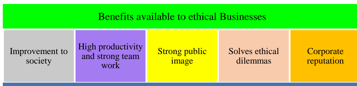
Figure 1. Benefits to Businesses

Figure 1 displays the benefits available to businesses for following ethical practices.