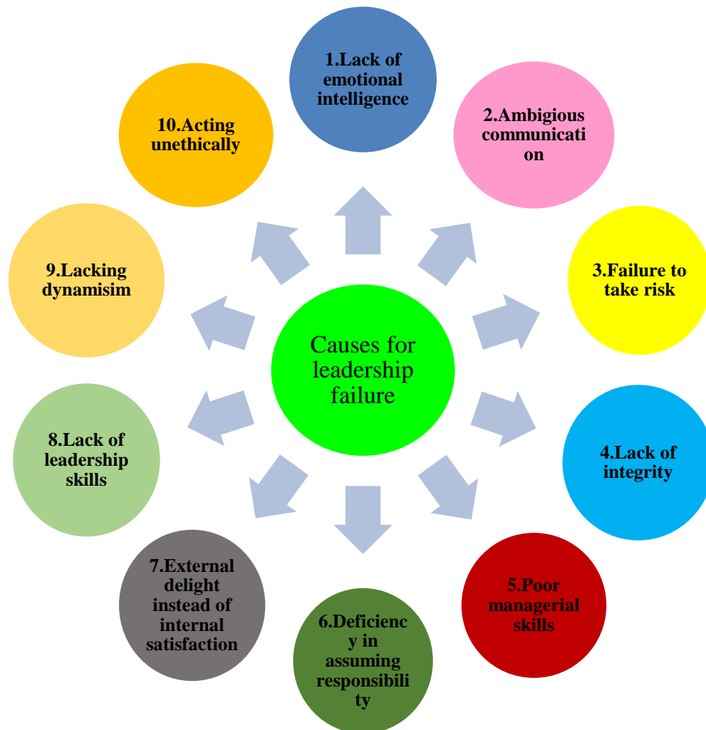
Figure 2. Causes for Leadership failure