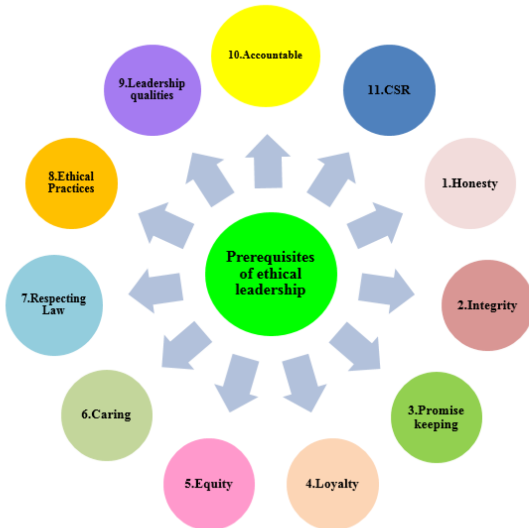
Figure 3. Prerequisites of ethical leadership

Figure 3 represents the basics prerequisites of ethical leadership.