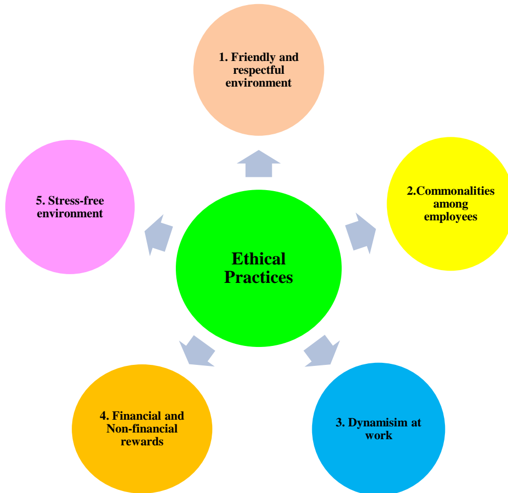
Figure 5. Ethical practices to ensure employees' job satisfaction

Figure 5 represents the essential ethical practices that are to be followed by leaders for ensuring employees' job satisfaction.