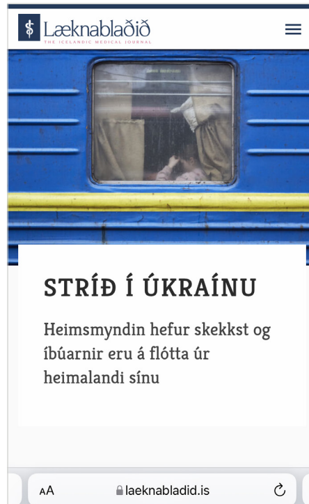
FIGURE 2. The Icelandic Medical Journal (Laeknabladid) is an open access peer-reviewed publication of the Icelandic Medical Association and the Medical Society of Reykjavik: Smartphone screenshot as of April 24, 2022. 21,18 Homepage news translation from Icelandic: "War in Ukraine. The worldview has been distorted and the inhabitants are aloof from their homeland." 15