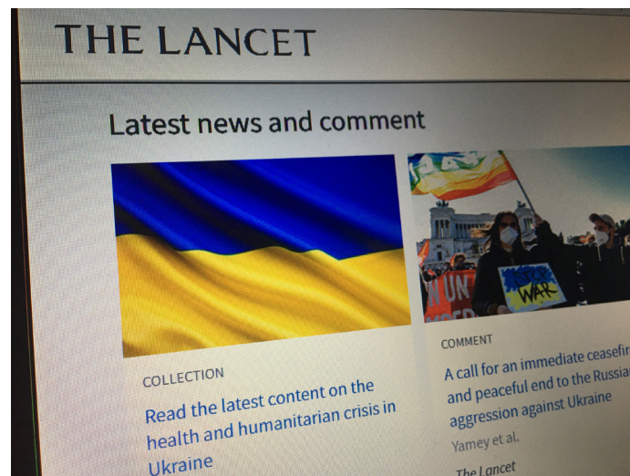
FIGURE 1. The Lancet is one of the most prestigious peer-reviewed publications among international general medical journals. Its Impact Factor is 202.731. Photo from the laptop screen as of April 8, 2022. 20

The Figures 1, 2, and 3 clearly demonstrate the international journals' contribution to the peace on European continent.