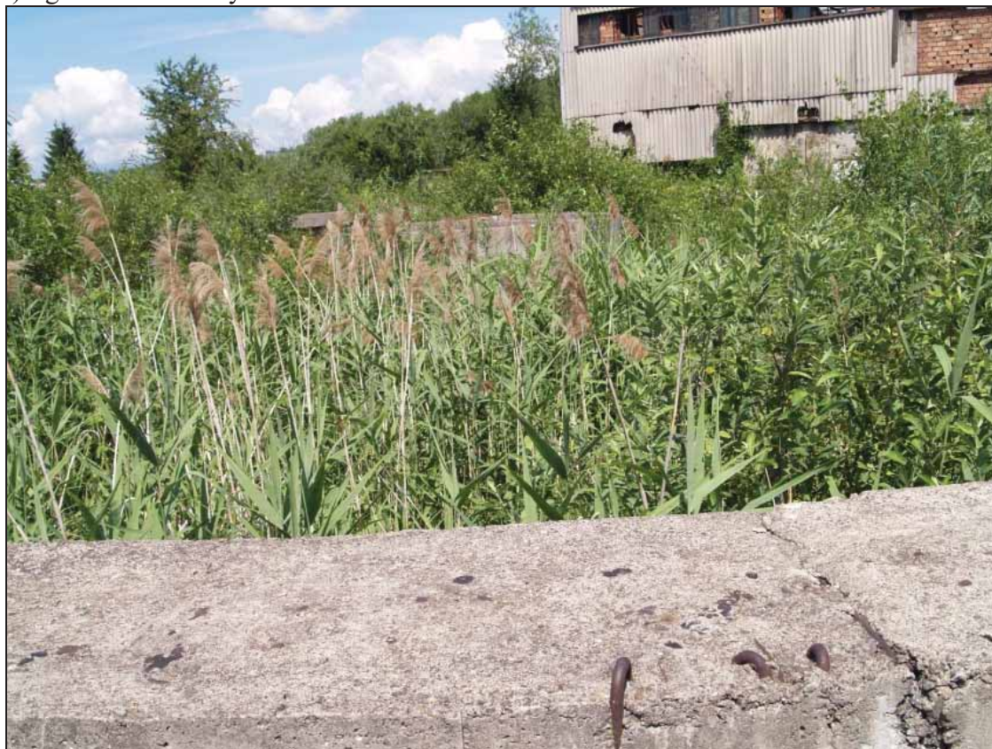
Figure 4. Decanter (101) used in Method 4 for bioremediation

This soil is proposed to be decontaminated by bioremediation (up to 60 cm depth = 965.52 m 3 and a mass of 1,581.83 t) will be stored and decontaminated in Decanter (101 in Figure 1) right in the vicinity of the contaminated site.