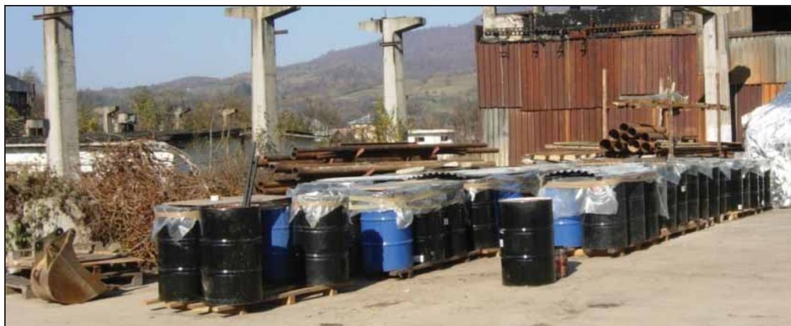
Figure 2. Barrels with a capacity of 200 l

Stage 2: Collection and disposal of fuel oil from storage, pumping station, oil separator, oil collecting groove. Cleaning of reservoirs, pumping stations, underground concrete channels (Figure 3).