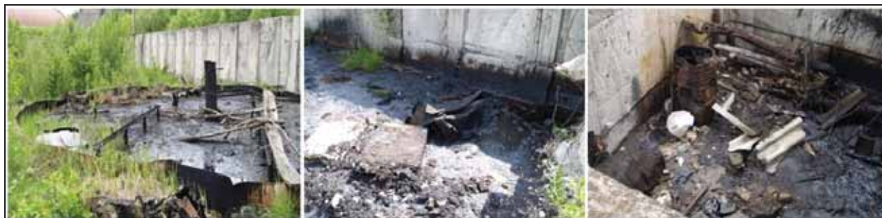
Figure 3. Liquid and solid asphalt fractions to be removed in Stage 2

Stage 2: Collection and disposal of fuel oil from storage, pumping station, oil separator, oil collecting groove. Cleaning of reservoirs, pumping stations, underground concrete channels (Figure 3).