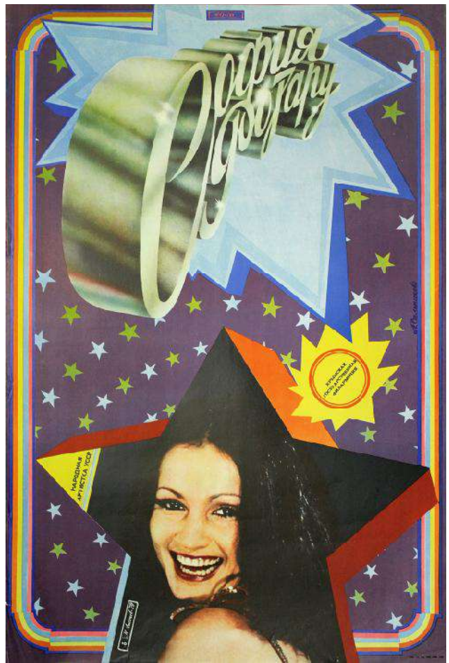
Гл. 2. Ю. Аксьонов. Плакат. Київ, 1979

«...» [16, с. 393], « [ ... ] , ...» [3]. 1970- 1960- .