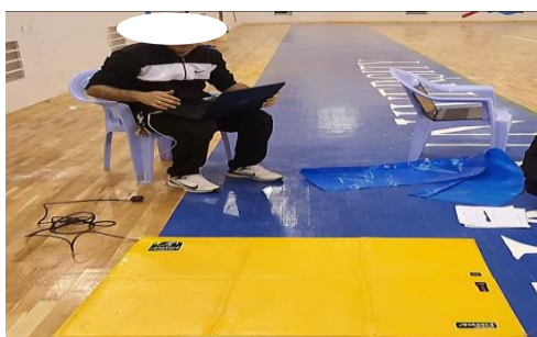
Fig. 2. Jump Mat Device