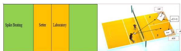
Fig. 3. Test the accuracy of the performance of the spike skill (Straight and diagonal) and blocking

A particular device (jump mat) number (1) with dimensions (50 x 110 cm) was used to measure kinetic variables directly in the course of performance. Among these variables is a vertical jump in centimeters. The experiment was carried out on the jumping mat competence of the mechanics/volleyball.