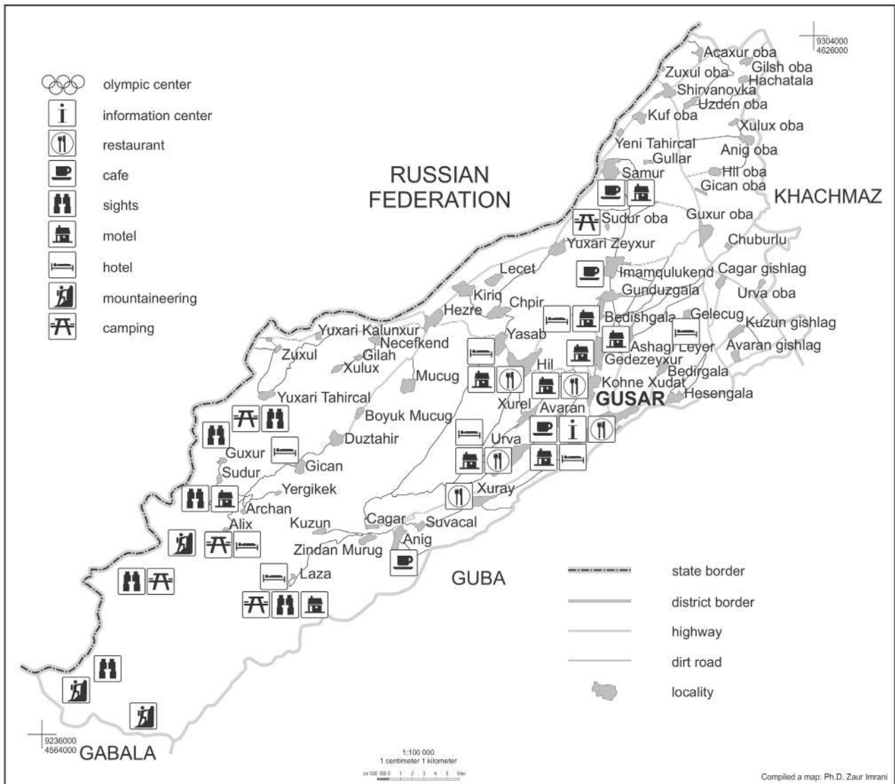
Fig. 2. Zoning map of tourism and recreation resources of Gusar region

recreation resources. The first zone includes areas that are more developed than other areas in terms of the pace of development of the tourism sector; the second zone includes areas that are attractive and moderately developed in terms of ecotourism; and the third zone includes areas that are relatively underdeveloped despite their potential.