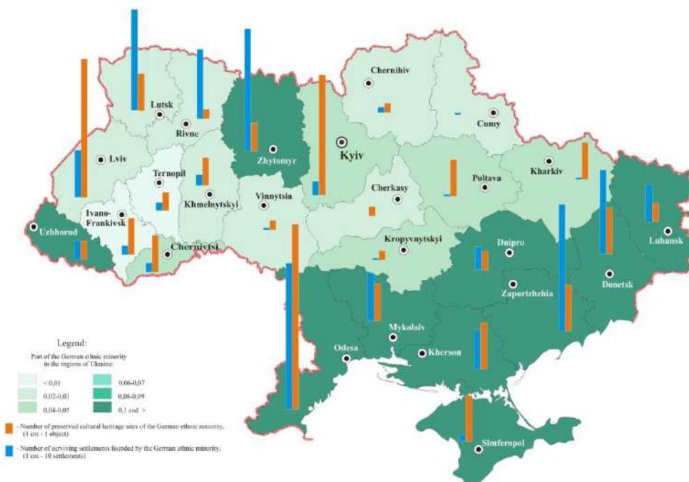
Fig. 2. Geography of ethnic Germans and German cultural heritage in the modern Ukraine (developed by the authors)