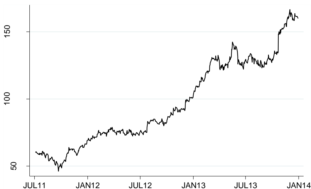
Figure 1. Canadian Public Stock Performance. July 1, 2011 to December 31, 2013

Notes: September 22, 2011, CAD 46.22 — Pershing Square begins to accumulate shares in TSX:CP October 28, 2011, CAD 63.80 — Pershing Square files original 13D January 4, 2012, CAD 70.60 — Ackman email to CP's Cleghorn February 6, 2012, CAD 74.34 — Ackman and Harrison hold public "Town Hall" meeting April 4, 2012, CAD 75.34 — Ackman letter to shareholders May 17, 2012, CAD 76.51 — CP Annual Meeting — Successful proxy contest and CEO replacement April 13, 2013, CAD 125.61 — CP announces best quarterly results in its 132-year history May 17, 2013, CAD 142.42 — One year after proxy contest and CEO ouster, share price is up 86% June 5, 2013, CAD 126.00 — Share price drops as Pershing Square announces intention to reduce ownership position to 10% October 23, 2013, CAD 148.53 — Share price exceeds CAD 150 on intraday trading on CP announcement of record 3rd quarter results and the best operating ratio in company history