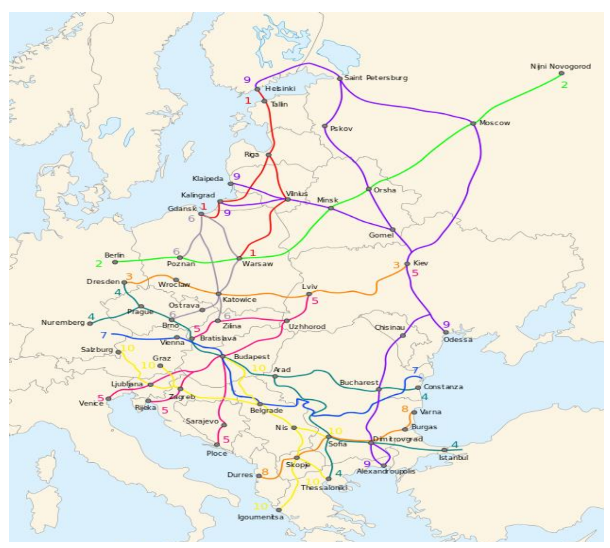
Figure 1 – Scheme of major pan-European international transport corridors

Ukraine has an active policy of supporting European initiatives on international transport corridors, and offers its variants of corridors to the European Community [7]. Currently there are 10 pan-European corridors (Figure 1).