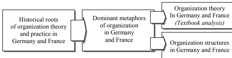
Fig. 1. Argument chain of the study

The differences between the images that underlie the way German and French scientists and practitioners approach organizations may basically be reduced to two metaphors: chart and sail. In German organization theory and practice there is a dominant image of an organization as an essentially centripetal entity and as a structure for the efficient differentiation and integration of individual tasks with a view to a common, tangible goal. French organization theory and practice, however, is predominantly determined by an image of an organization as a temporary arrangement and common guiding image for its various interested parties towards the achievement of a given goal.