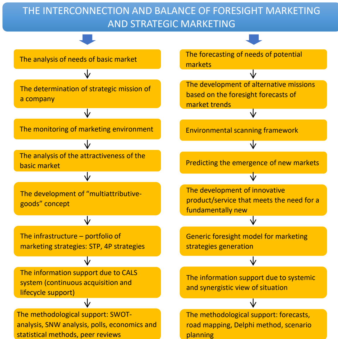
Figure 2. The interconnection and balance of foresight marketing and strategic marketing

Management of strategic marketing in the company involves the formation of a controlled external environment through the development of relationships with partners and designing a network context, the development of the company that allows to increase the strategic potential and to provide a competitive advantage. Thus, it is clear that, to ensure a dynamic strategic vision as the basic concept of foresight marketing, marketing thinking based on foresight is impossible to imagine without the active support of strategic marketing, the interconnection and the balance of which is schematically shown in Figure 2.