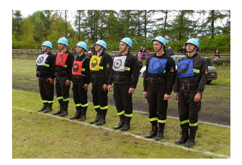
Fot. 1. Volunteer Fire Brigade team – at competitions

the Descartes platform. People from the age of 15 took part in the study.