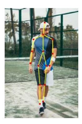
Figure 1 – An example of determining the body pose in the image

When recognizing pose, usually do not pay much attention to facial recognition, but only to the position of the head. Nevertheless, there are certain scenarios where face recognition can be useful as well. For example, in some applications such as surveillance or security, it may be important to detect the identity of a person based on both posture or body language and their face. There are several classic methods for face recognition that have been used over the years like Eigenface, Fisherface or Viola-Jones algorithms, and wavelet transform [2].