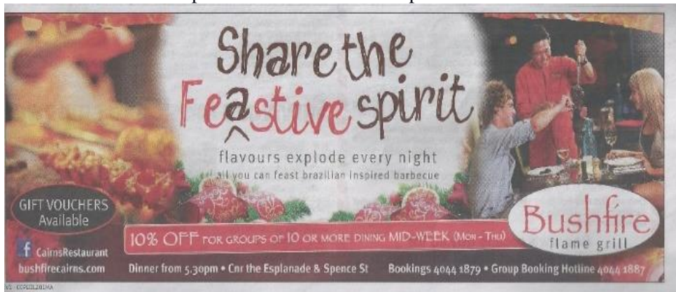
(The Herald Sun, 4 Aug, 2018).

A language game engages mind, being often used in headlines and sub-headlines and is a very powerful attention-catching means. A relatively new way of a language game is a graphic language game which is based on shortenings and abbreviations, an unusual spelling of words, modifications of their visual representation, intended mistakes, substitution of letters with iconic images, variation of a colour scheme or fonts and letters sizes. All these visual stylistic means help to achieve humorous and emotional effects, converting commercial ads into the memorable and persuasive ones. For example: