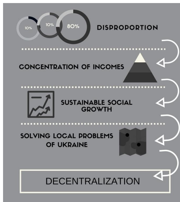
Fig. 1. Decentralization in the context of inclusive sustainable growth

Conception of inclusive sustainable growth was shown at first in the UNDP's report in the context of "Policy of inclusive and balanced growth aim". "Inclusive" is the official term of UNDP, with analogy all inclusive. This is growth, in which marginal society segments perform as the main policy object independently of sex, age, nationality, sexual orientation, physical ability and economic situation [4]. In author's opinion, it's necessary provide "inclusion" of all society groups in good of economic development using and promote shortening of breaches in incomes and prosperity. This, in its turn, should not only give social advantages and lead to acceleration of economical growth. (fig. 1)