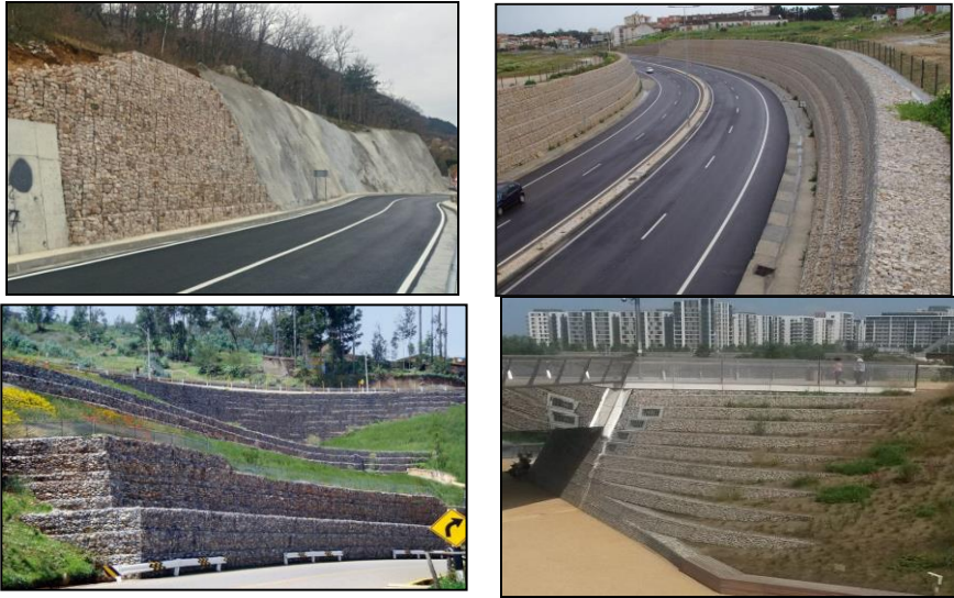
Fig. 1. Examples of gabion retaining walls [6]

General design principles. Gabion retaining wall is a flexible structure that holds the soil with its own weight. It is constructed according to the same principle as a gravity wall: a significant mass of stone in gabions must resist shear forces from the soil and external loads. At the same time, the gabion mesh should hold the stones inside with a slight deformation that will not affect aesthetics and internal stability [8].