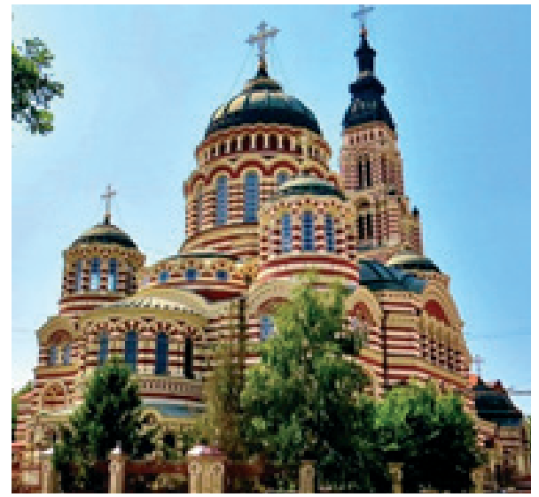
Fig. 6. Annunciation Cathedral, 2020