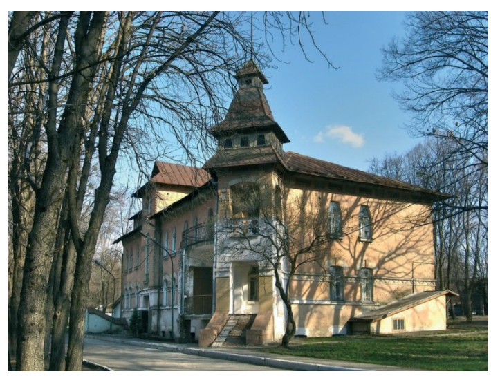
Fig. 1. The main building of the Kharkiv Agricultural Breeding Station

self-valuable, saturated with active creative searches in art, which gave rise to a whole galaxy of outstanding cultural figures. Modern implemented the then-popular creative concept of "synthesis of industry and art", extracting greater freedom in architectural shaping from new technical possibilities: now it was possible to significantly increase the number of stories of buildings, block large spans and diversify the plasticity of space by using suspended bay windows, intricate turrets and very active plastic decor. Into architecture "free" plans and plastic polychrome facades were quickly introduced. The interiors used plywood screens, colored stained glass, woodcarving, canvas and wallpaper, and decorative fabrics with multicolor and textured designs [2].