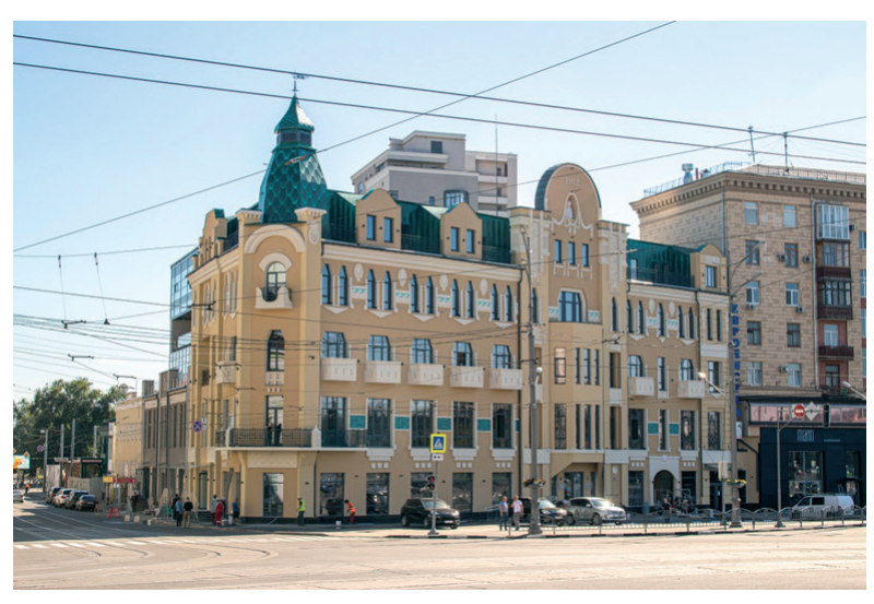
Fig. 4. Kharkiv Bureau of Technical Inventory, 2020, photo by Ivan Ponomarenko, from open sources, after a complete restoration in 1992, this house was re-updated a few years ago (partially damaged on 27 August 2022)

choice of location of this house was not accidental, here the then Trade Square often held fairs and various city mass events. After the revolution of 1917, it was the House of the Collective Farmer, with hotel rooms, a dining room, and public premises.