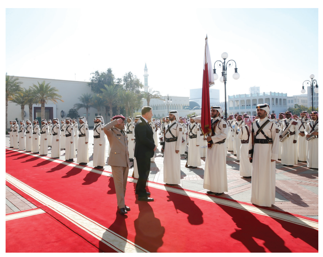
Надзвичайний і Повноважний Посол України в Державі Катар Андрій Кузьменко оглядає почесний караул Еміра Катару під час офіційної церемонії вручення Вірчих грамот (Доха, внутрішній двір палацу Еміра, 16 лютого 2020 р.)