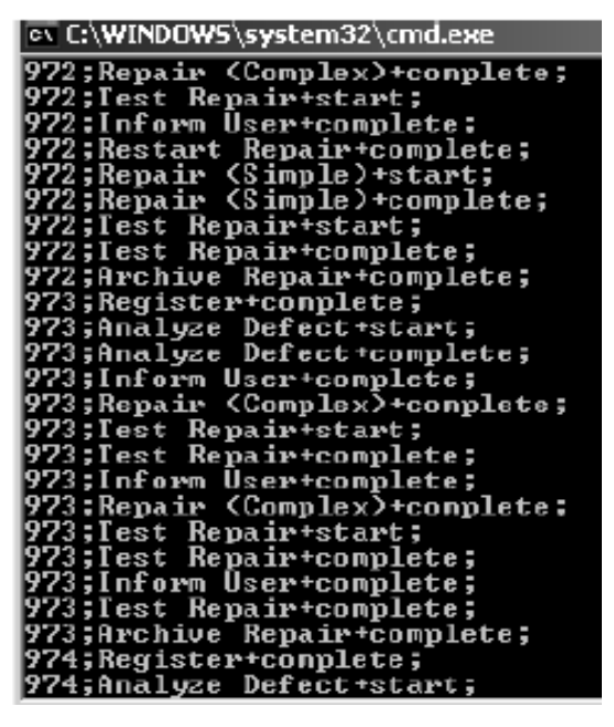
Fig. 3. New event log.

model, improves its overall characteristics, allows for a more accurate diagnosis and offers the patient emergency measures.