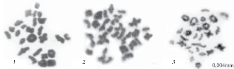
Fig. 2. Chromosomes of Arion spp. in the diakinesis (meiosis) (n): 1 — A. distinctus ; 2 — A. fasciatus ; 3 — A. fuscus .

chromosomes are represented by submetacentrics (sm); the remaining pairs are metacentric (m) (fig. 1, 2). The chromosomal formula is 2n = 44m + 6sm + 2st = 52 . The fundamental number is FN = 104 (Garbar, Kadlubovska, 2014).