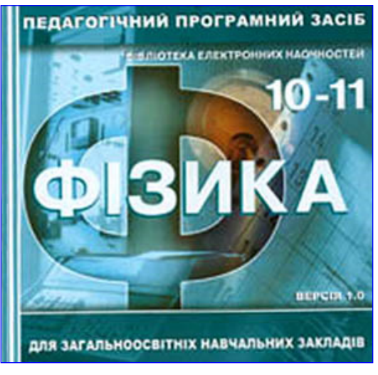
Image № 5. PST «Library of electronic visual aids. Physics, 10-11 classes»

PST «Library of electronic visual aids. Physics, 10-11 classes» ( image N \ge 5 ) is for general education institutions. It is oriented on modern forms of education, is compatible with traditional educational materials, fully complies with the documents, which regulate the content of education. PST contains pictures, videos and animation from all topics of the physics course in school. It can to supplement the program-methodical complex «Physics, 10-11 classes» or can be used independently.